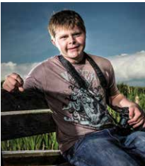
Photographer Oliver Hollowell

With an eclectic mix of artwork from painting to photography to line drawing, witness how this condition can showcase unique perspectives and original insights.